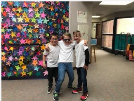
Thanks to PGEA for another successful Sock Hop! Such a fun tradition for our school!