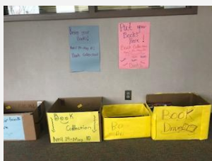
Students who are a part of PGE's Community Service Team have been busy collecting book donations as a collaborative service project with Chaparral HS