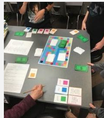
Students in Mrs. Tuggle's STEM elective class used critical thinking in their challenge to create games around a certain topic or content area. Students designed the game boards and even printed game pieces on the 3D printer!