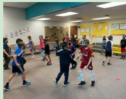
Students learning to square dance while counting musical beats in Music class.