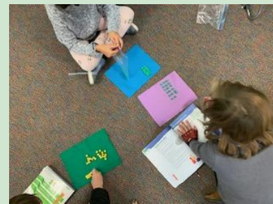
Using our new math curriculum, students show their math strategies with partners.