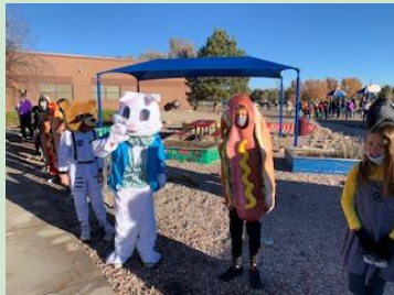
Students & Staff enjoyed our annual Halloween Parade and classroom parties!